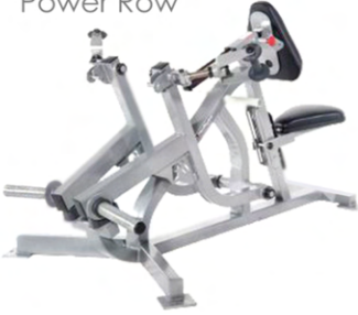
RPL-3 Power Row