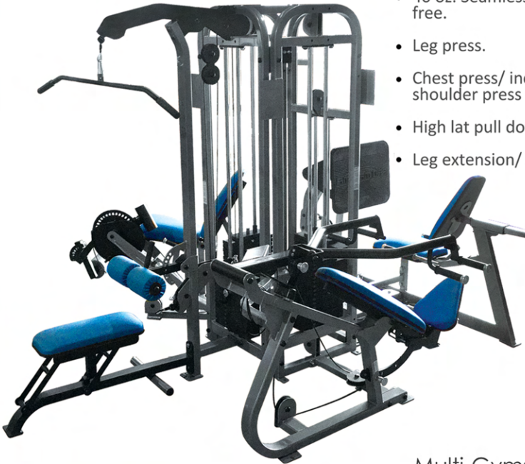
P-235-2 4 Stack Multi Gym