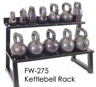
FW-275 Kettlebell Rack