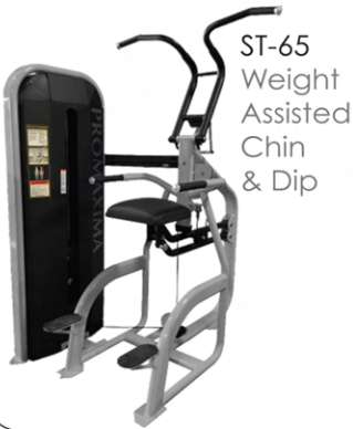
ST-65 Weight Assisted Chin & Dip