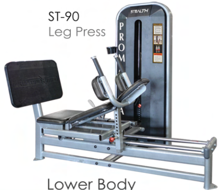
ST-90 Leg Press