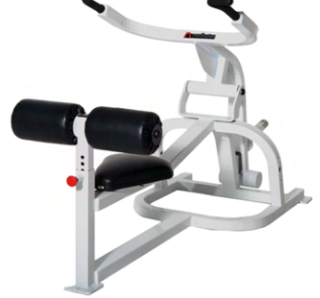
RPL-7 Tricep Press