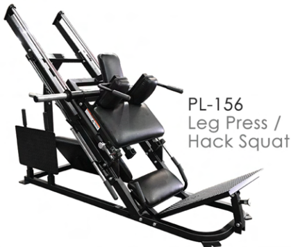
PL-156 Leg Press / Hack Squat