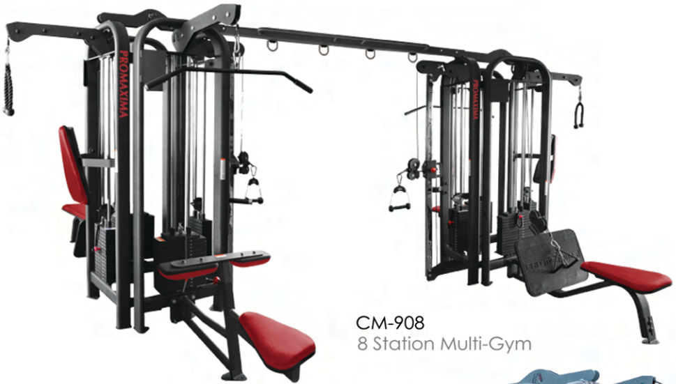
CM-908 8 Station Multi-Gym