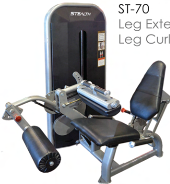
ST-70 Leg Extension / Leg Curl