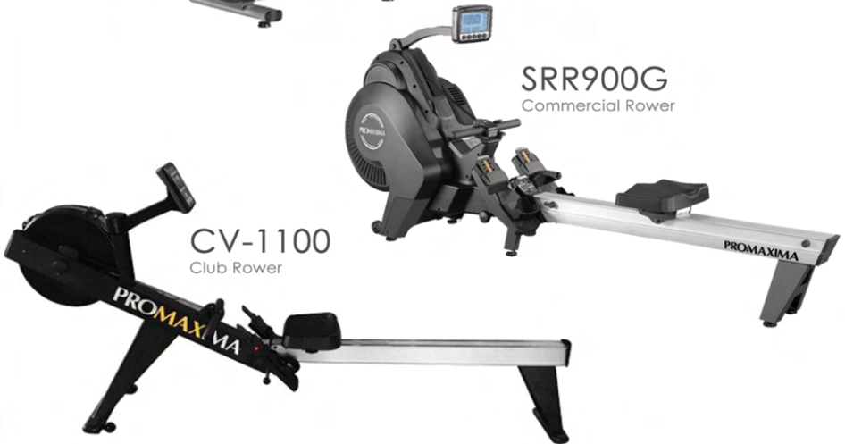
CV-1100 Club Rower