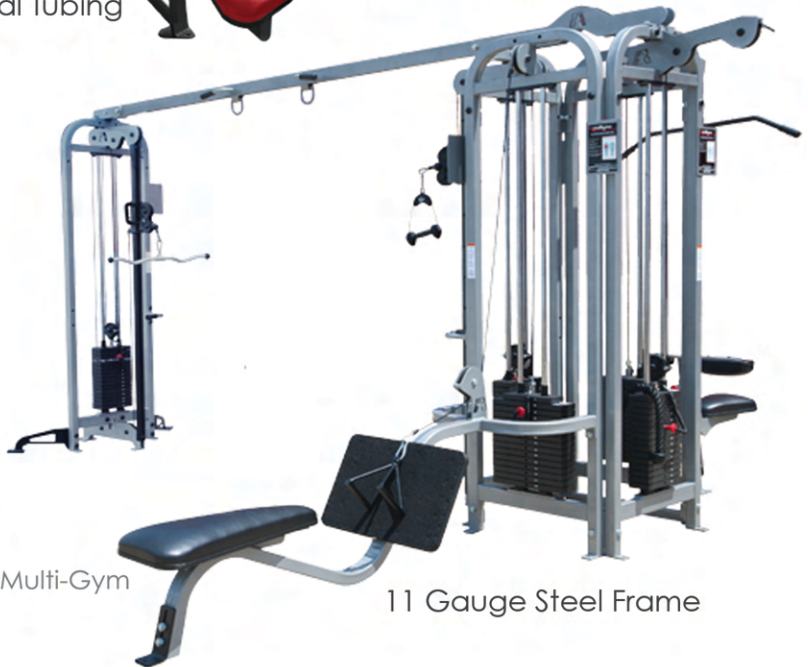
CM-705 5 Station Multi-Gym