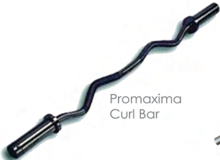
Promaxima Curl Bar