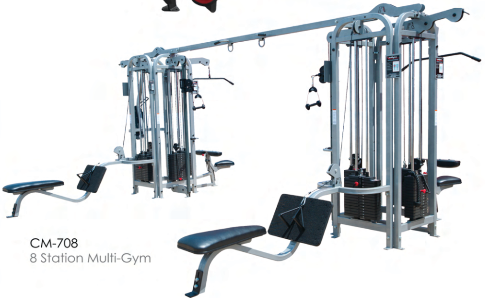
CM-708 8 Station Multi-Gym