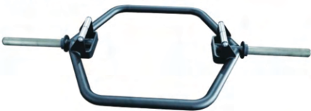
Promaxima Trap Bar