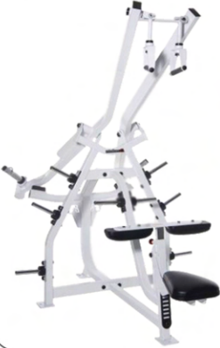
RPL-76 Hi Lat Pull

View our full line of Leverage Equipment at promaxima.com