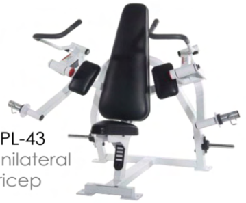
RPL-43 Unilateral Tricep

View our full line of Leverage Equipment at promaxima.com