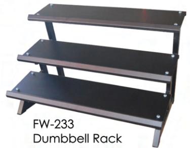
FW-233 Dumbbell Rack