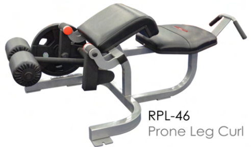
RPL-46 Prone Leg Curl