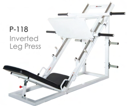
P-118 Inverted Leg Press