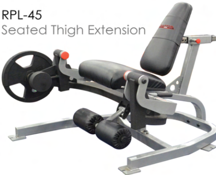
RPL-45 Seated Thigh Extension