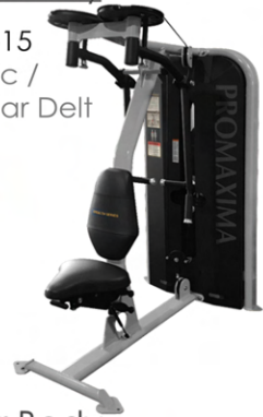
ST-15 Pec / Rear Delt

View our full line of Stealth Selectorized at promaxima.com