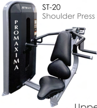
ST-20 Shoulder Press