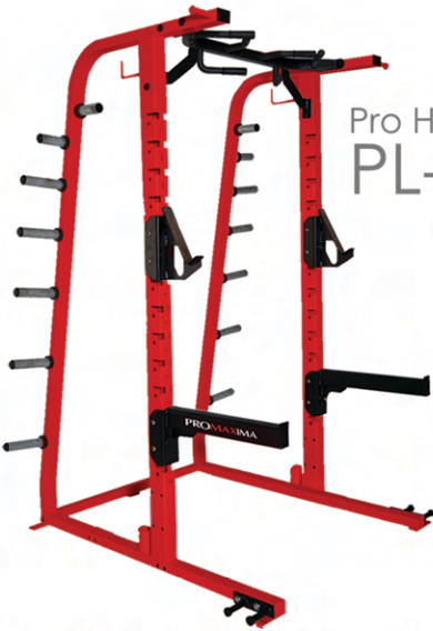
Pro Half Rack PL-340