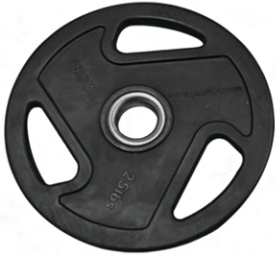
Rubber Encased Grip Plates