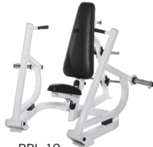
RPL-12 Vertical Chest Press