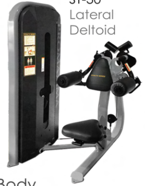
ST-30 Lateral Deltoid