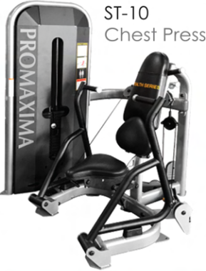
ST-10 Chest Press