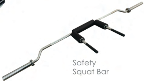
Safety Squat Bar