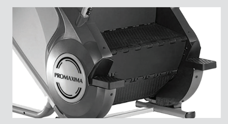
NON-SLIP, 8" FIXED STEP, REVOLVING STAIRS

Designed for maximum level of intensity.